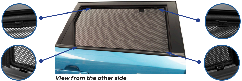
View from the other side