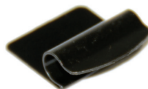
CL-M12 x 2