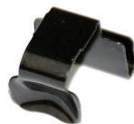
CL-M05 x 4